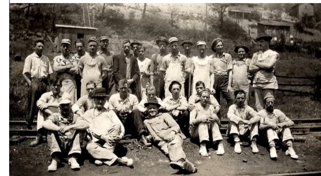
Cameron Pottery Workers, Circa 1930