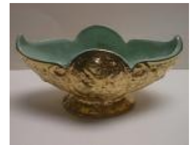
Vintage Sunburst 24 Kt. Gold Planter Flower Vase