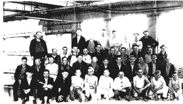
Pottery Workers, Cameron, W.Va., 1940's

There was a large and airy kiln shed which contained six kilns, - two bisque, two glost and two double decorating kilns.